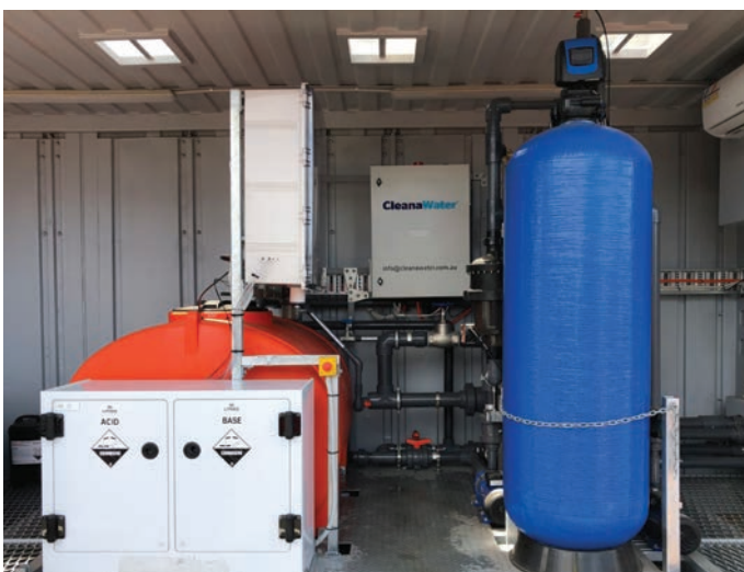
CleanaWater Closed Loop Water Recycling System