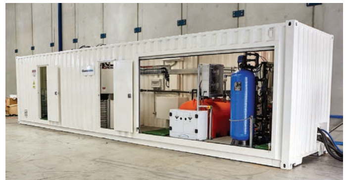
CleanaWater Multi-purpose Water Recycling System in 40ft Shipping Container