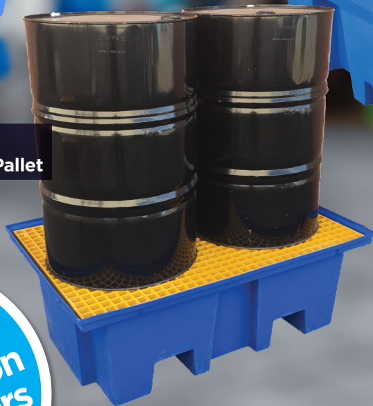
2 Drum Bundled Pallet