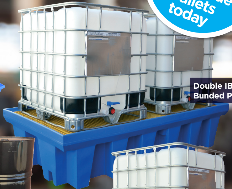
Double IBC Bundled Pallet